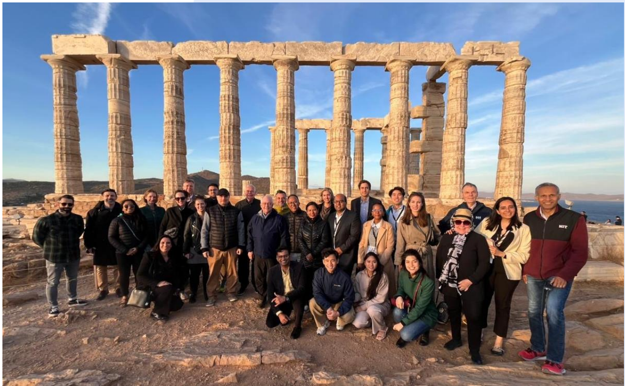
Participants and faculty of SHIFT5 in Athens, Greece. November 2024. Temple of Poseidon at Cape Sounion at sunset.